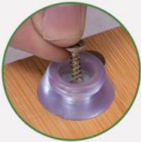
Installed with Small Screws (i)