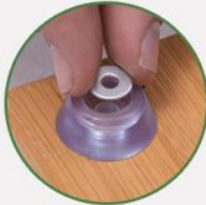
Insert Shim (g)