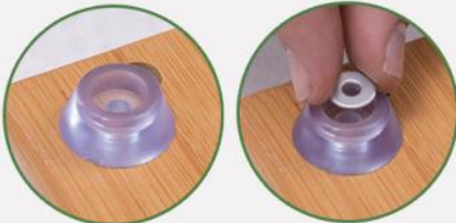
Place Pad (f) on the hole.