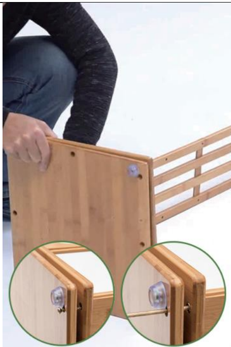
Install screw through the hole